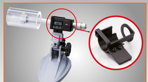
HOLDER FOR MICROMETER STAND 04AZB157 incl. Micrometer Stand 156-101-10