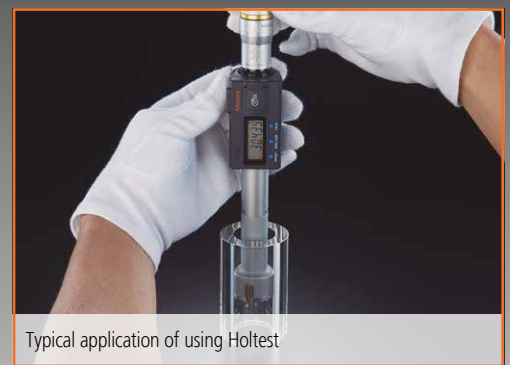
Typical application of using Holtest